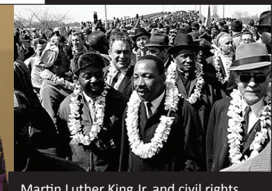
Martin Luther King Jr. and civil rights marchers - 1965