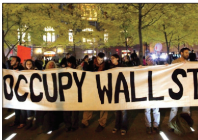
Occupy Wallstreet - October 2011